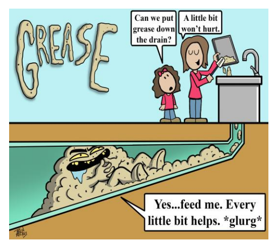
Don't be this person! There's no "acceptable" amount of grease that can be poured down the drain. Remember that if every house dispose "a little bit", then all the little bits combined becomes a big problem!