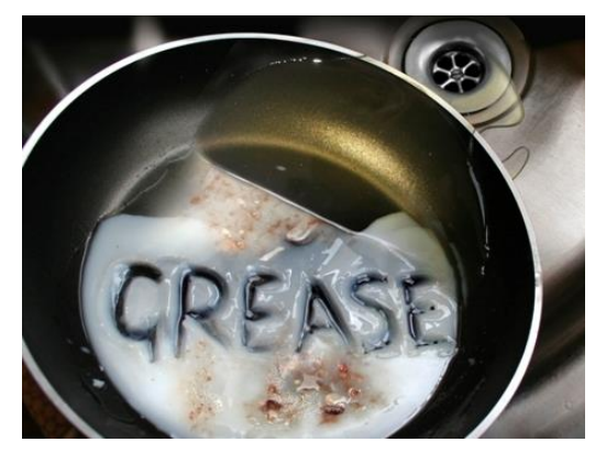
When fats, oils, and grease (FOGs) are washed down the drain, they stick to pipes and may lead to sewer system problems!