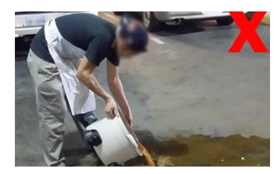
Definitively do not be this individual! The disposal of FOGs into parking lots and open areas isn't only illegal, but it is damaging to the environment. At the next rain or snow melt, water will push those FOGs ultimately into our rivers.

And don't transfer the problem from our sewer pipes to the environment. Dumping FOGs into parking lots and the environment is very much illegal!